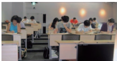
Participants of PMP® preparation course taking a mock examination