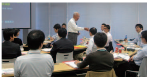
Lecture at Capacity Building Training for Project Managers