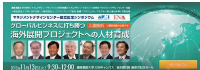
Symposium commemorating the Center's establishment in November 2012

The Center aims to nurture human resources that society needs by improving Keio SDM's curriculum and by organizing study groups, seminars, and symposiums. Some of the events organized by the Center are open to the general public. Please feel free to take part in the Center's activities. We would be happy to receive your comments and requests concerning the Center's roles and activities.