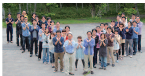
Joint camp by the System Design Methodology Laboratory and the Human Laboratory

We organize "Extended Human Laboratory" seminars every Saturday afternoon jointly with the Human Laboratory.