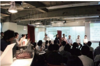
Launch event at Kannai Future Center