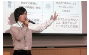
Presentation by students

In addition to the instant and devastating damage dealt to the residents of Fukushima on March 11, they are still suffering from the after-quakes, the nuclear-power accident, harmful rumors, and other problems—even six months after the Great East Japan Earthquake struck. The Fukushima Disaster Restoration Project was launched to solve such large-scale complex problems.